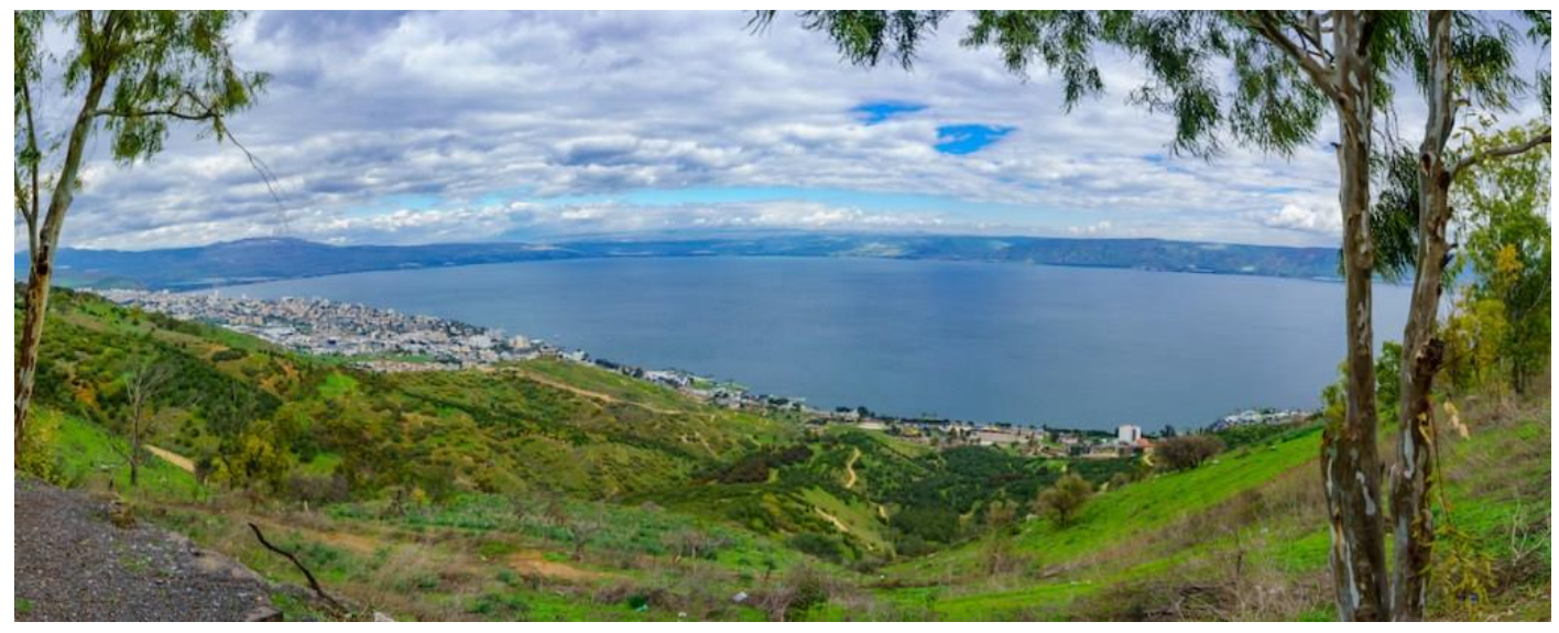
The Sea of Galilee

Go in peace. May the whisper of God's wisdom go with you today into all your relationships. Amen.